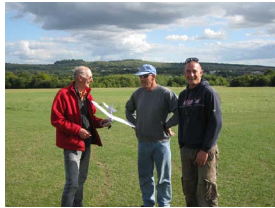
Emwanezer, Cox 020 power + recovery team!