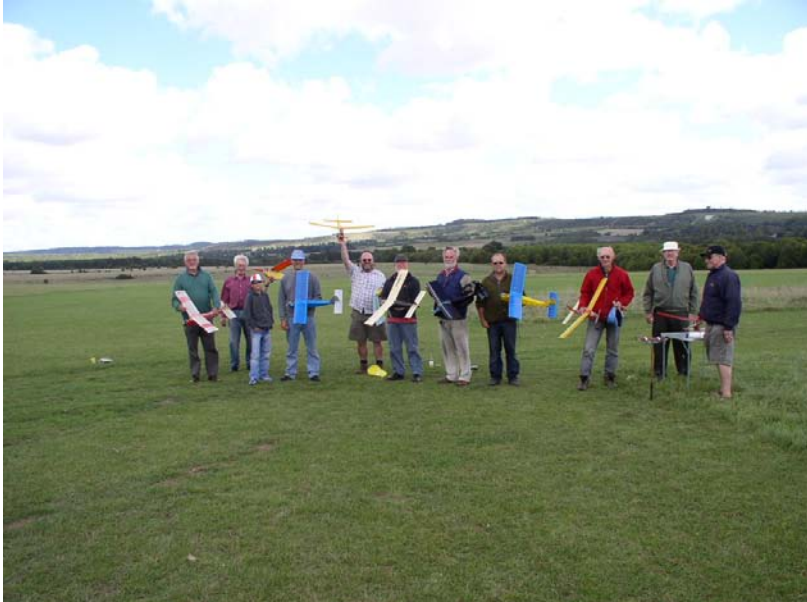
Tomboy 36 Fly-off