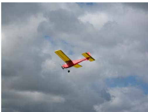
and they're down

More information about the Wessex Aeromodellers League and results to date can be seen at: www.wessexaml.co.uk