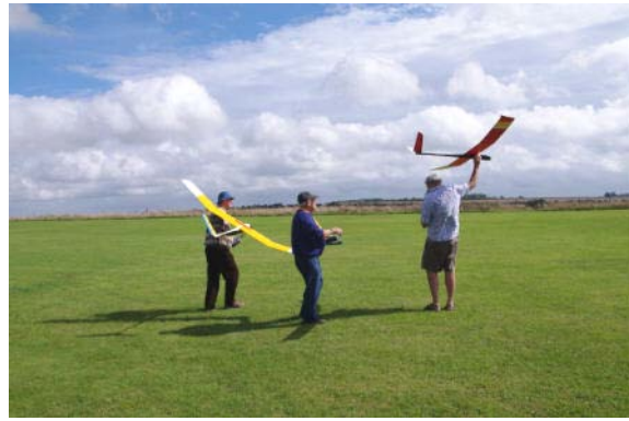
Assembling for the off