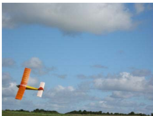
Derek Collin doing a stunt take off