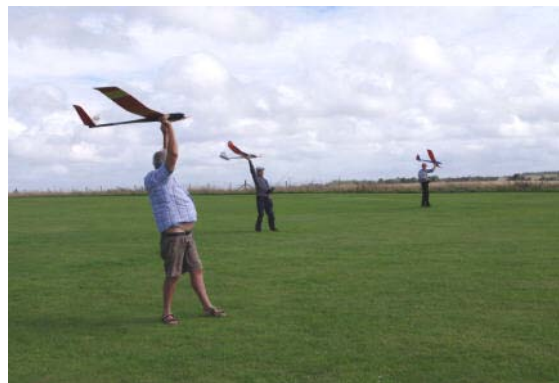
On your marks, get set.....