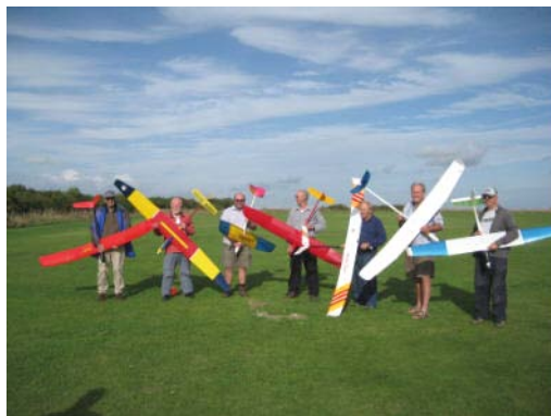
The happy band