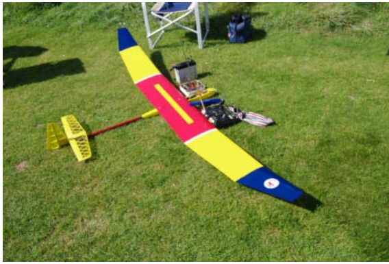
Rick Farrer's Watts-Up 600RES model