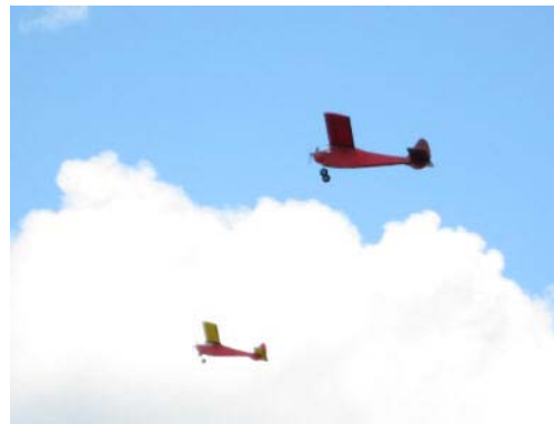
and they're up.....