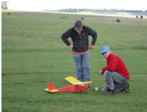
The waiting game